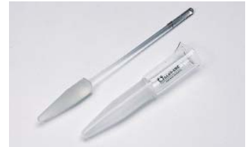
Homogeniser with overflow flare with lip and glass pestle, tapered