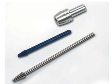
EPPI-pestle made of polypropylen and stainless steel with quick-grip clamp