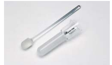
Homogeniser with overflow flare with lip and glass pestle, cylindrical