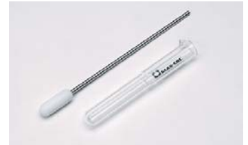
Homogeniser with overflow flare with lip and teflon pestle, cylindrical