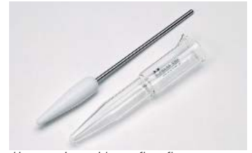
Homogeniser with overflow flare with lip and teflon pestle, tapered

Please moisten pestle and homogenising vessel before homogenising. Carefully insert the pestle into the homogenising vessel at a low rotational speed.