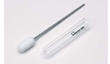
Homogeniser as centrifuge tube with teflon pestle, cylindrical