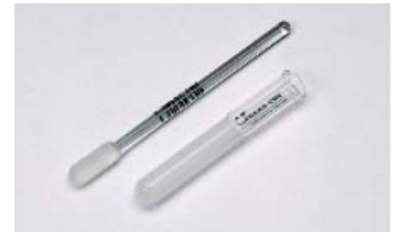
Homogeniser with overflow flare, without lip and glass pestle, cylindrical